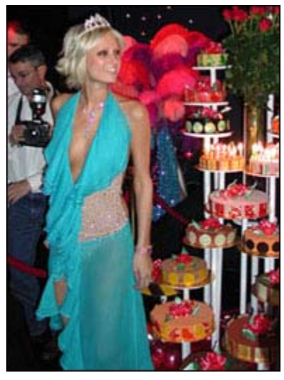
For once, the Raiders may actually pay attention during the video meeting.