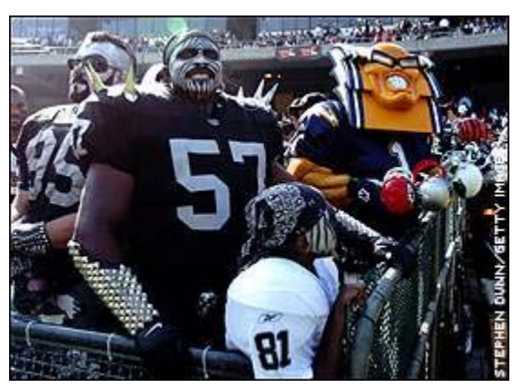
Do these fans have what it takes to play for the Raiders?

Correct answer: D -- Every classic needs a modern refurbishment.