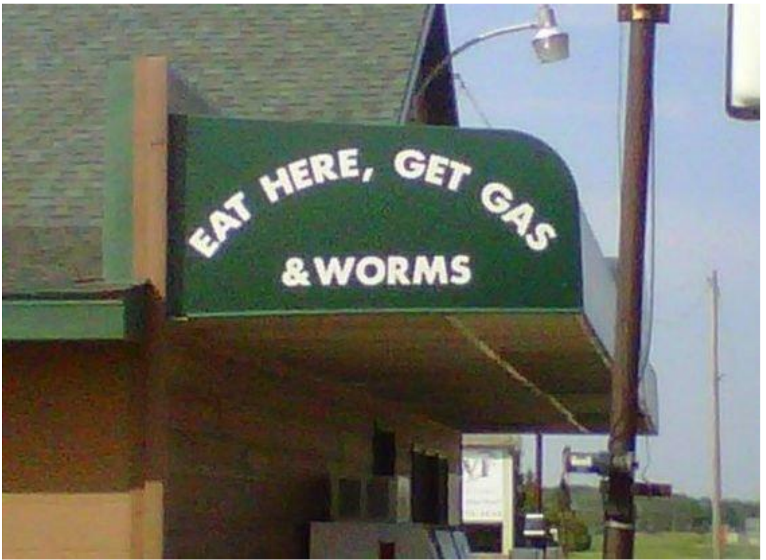
MASTER BAIT SHOP